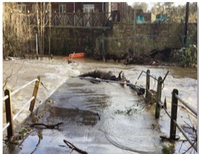
Top: Winsley Hill. Left: opposite the Inn at Freshford. Above: Freshford Mill bridge

Bradford on Avon is said to have suffered its worst flooding in a decade, with water levels in the area of the town bridge reported to be thigh-high in places following torrential downpours.