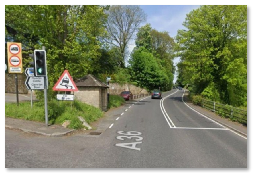
A36 junction with Brassknocker Hill

resurfacing, and will be carried out signals, largely during the daytime